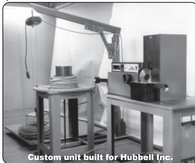
Custom unit built for Hubbell Inc.

cable length. Thanks to this feature, the Roto-Drive dispenses the exact amount of cable wanted eliminating costly rejects and rework. Accessories are available such as a motorized pay-off table with dancer for heavy coils and a heavy duty jib crane. Customized solutions are also available when requirements exceed normal specifications.